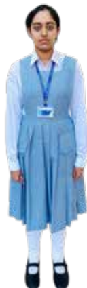
CLASSES IX - XII GIRLS (Full Sleeve)