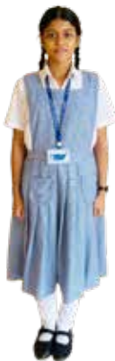
CLASSES IV - VIII GIRLS (Half/Full Sleeve)