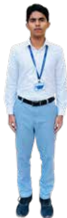
CLASSES IX - XII BOYS (Full Sleeve)