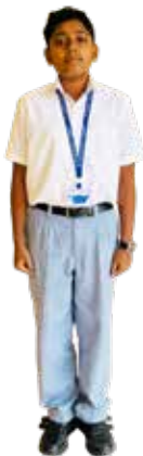
CLASSES IV - VIII BOYS (Half Sleeve)