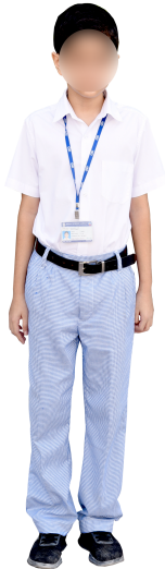
Classes IV-VIII Boys