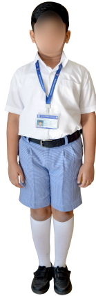
Classes I- III Boys