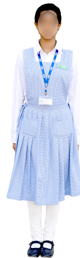
Classes IX -XII Girls