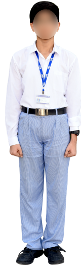
Classes IX -XII Boys