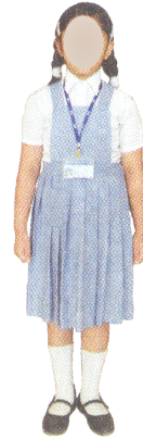
Classes I- III Girls