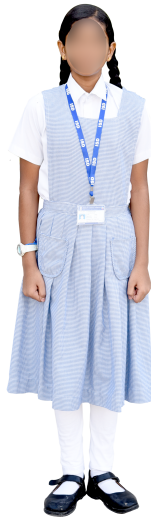
Classes IV-VIII Girls